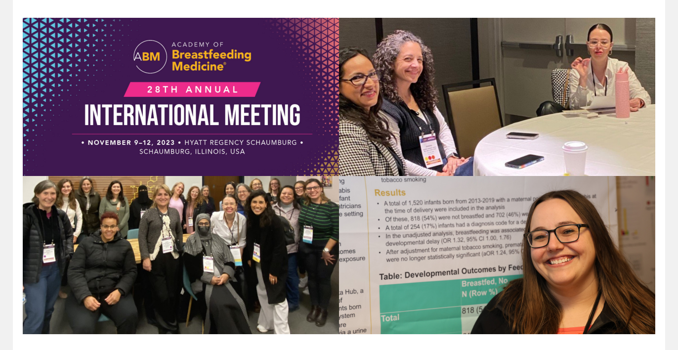
On Day 3 we took the time to honor our distinguished members, welcomed our new fellows and Leadership Academy participants, attended thought-provoking sessions, and tried out our new ABM swag (<u>shop here!</u>)