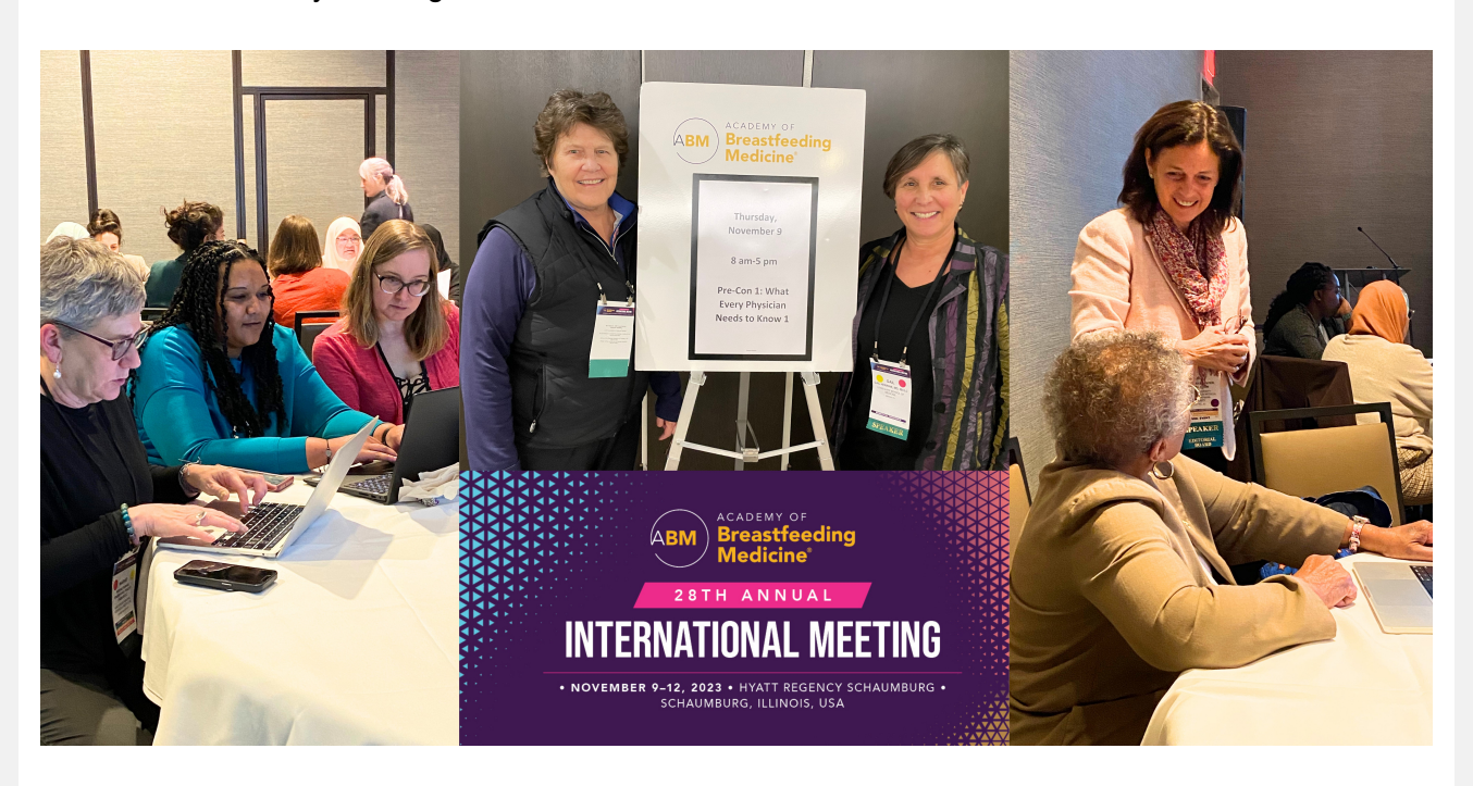
Day 2 included an update on the PCORI Grant's impact, Special Interest Groups met in-person for the first time, and more! In the evening attendees got the chance to visit the Mothers' Milk Bank of the Western Great Lakes to learn about the importance of donor education, how donated milk can be used, and how moms are supported after loss.